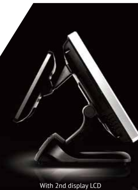
With 2nd display LCD

JIVA XT-3015 Series is the first to come from new Posiflex design language. Slimmer and sexier than ever, it is a sharp departure from the traditionally more conservative Posiflex terminal design. Every curves and details are carefully thought out to make JIVA XT-3015 Series one of the most visually desirable terminals in the market.