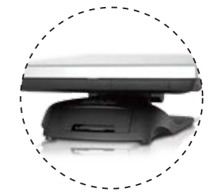
Flat Folded Mode