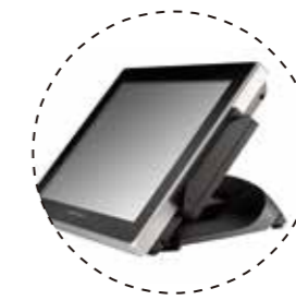
Low Profile Mode